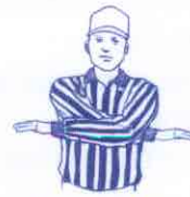
Incomplete forward pass