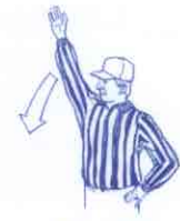
Penalty declined; no play