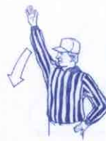
Ball ready for play