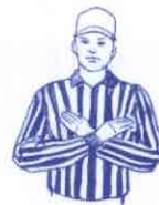
Delay of game