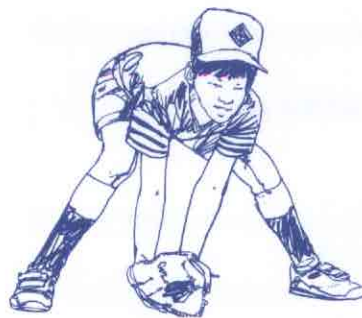
Catching a ground ball