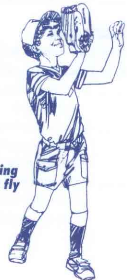
Catching a pop fly