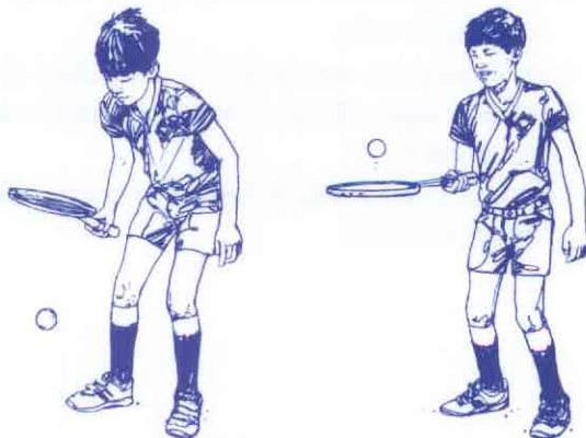
Bump-downs and bump-ups

A match is complete when one of the players wins two out of three sets (or three out of five sets in men's championship play).